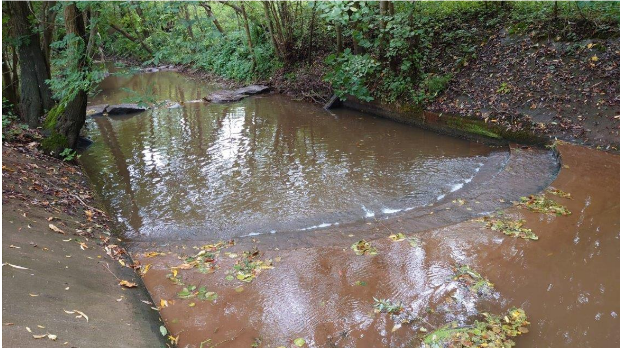
Image 2. View of the top of the stepped weir section looking downstream to the blockstone weirs.