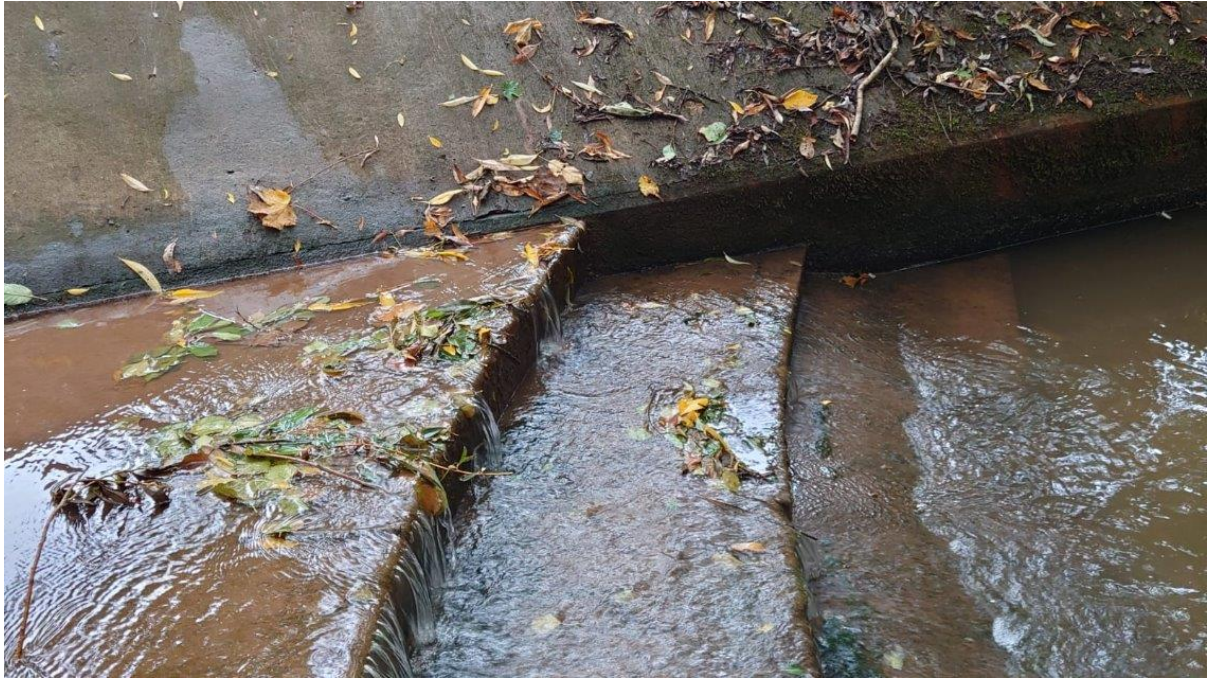
Image 4. Site photograph of the stepped weir. Note the man-made banks as well as the in-channel structure.