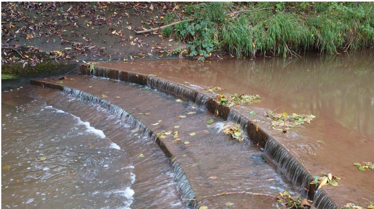
Image 1. Site photograph of the upstream stepped section of the Ledbury Weir from the left hand bank.