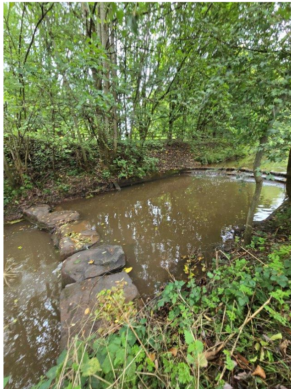
Image 3. Site photograph of the first blockstone weir looking upstream.